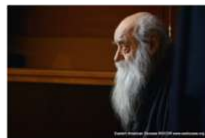
Jordanville update: how you touched lives at Holy Trinity Monastery Page 5