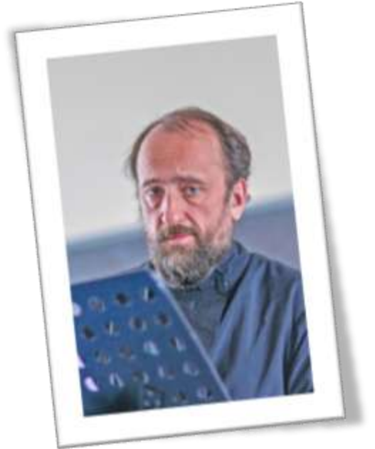
life to the history of our Church!

We are so grateful to you, our donors, for giving us the opportunity to help this amazing person. Because he is doing what nobody else seems to be doing in the world (at least to such a degree) – he dedicated his